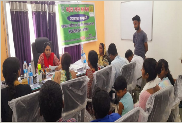
Stakeholder Meeting on Child Protection