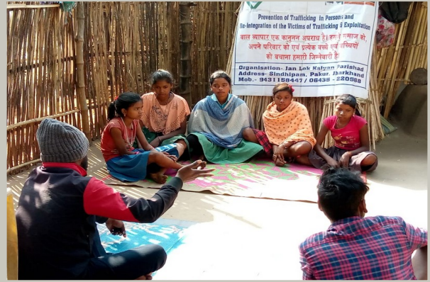
Formation of Adolescent group to stop Trafficking in villages