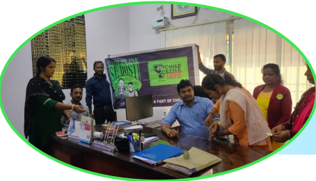
Childline Awareness program to protect child from child abuse.