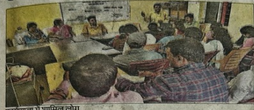
कार्यशाला में शामिल लोग।