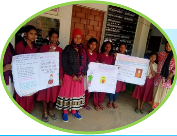
Celebration of International womens day through FCC.