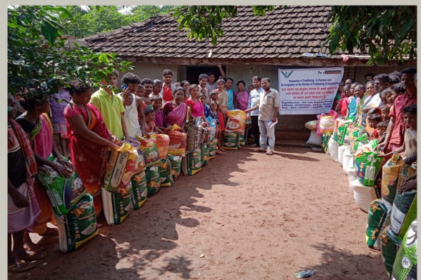
Hunger Allevation Program by JLKP