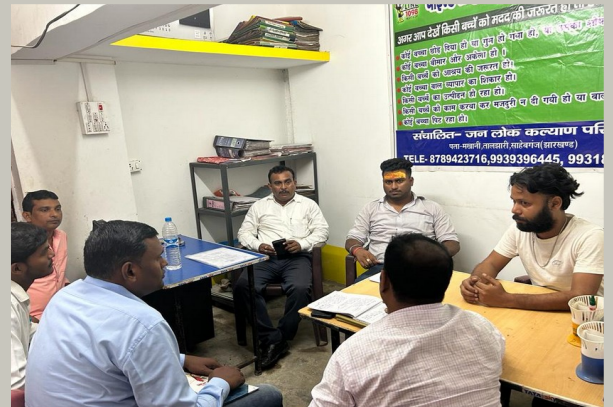
JLKP Team Follow Up Meeting with Program Team Child Protection and Development