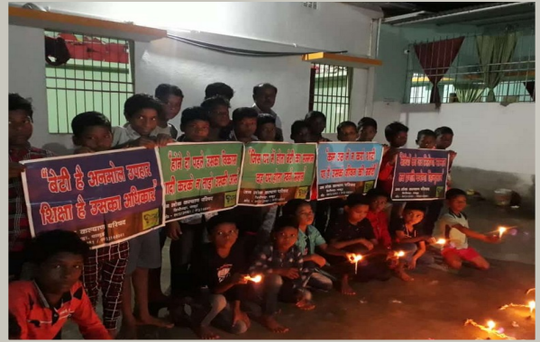
Awareness and march on Child Protection