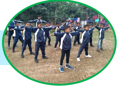
Childline se DOSTI (COLLAB) Pakur