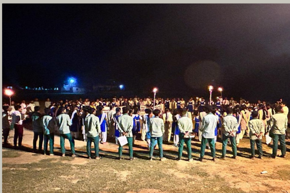
Masal Julus to end Violence against Children