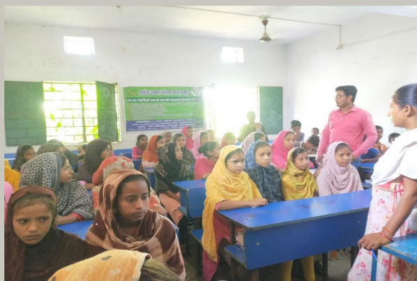
School Awareness Program on Child Marriage ,Child Sexual Abuse and Child labour