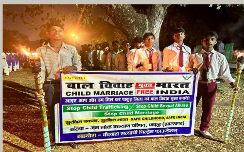
Gender Equity Program and Awareness