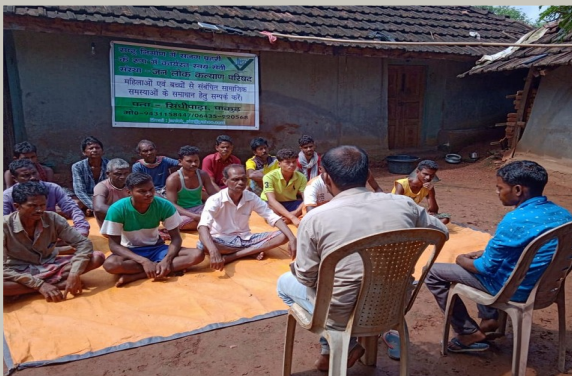
Awareness on Safety Net Creation