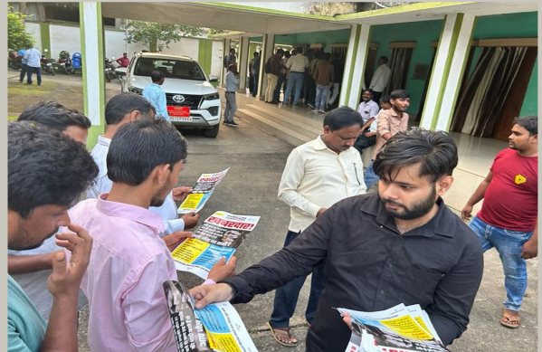
Leaflet and poster Distribution