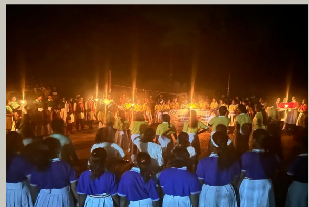
Awareness on child right through Sports and Events