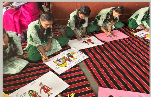
School Awareness on Child Right