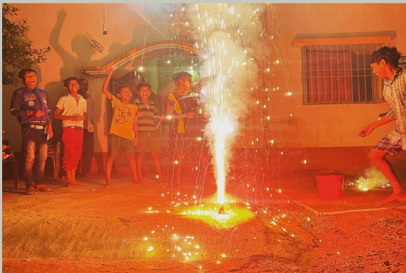
CCI Child celebration Christmas