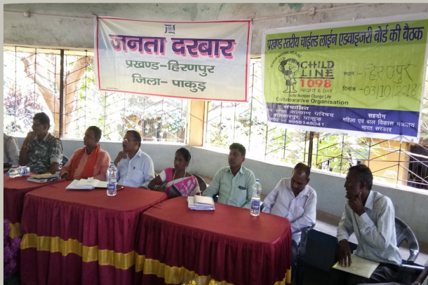
Child Protection Service with liasioning of Government department