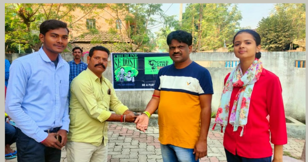
CHILDLINE Se Dosti Program