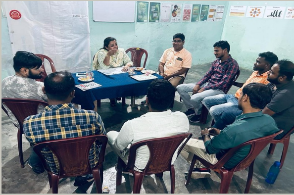
Jhpiego India team Discussion with Field Staff